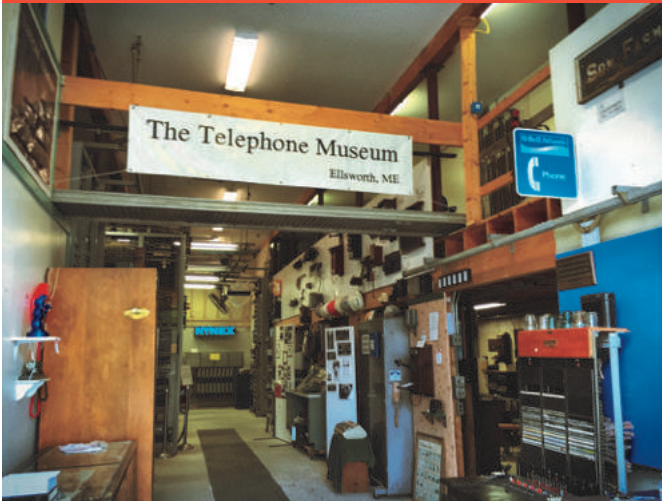
The Telephone Museum – Barn

The looks on the faces of all of the guests and visitors made all the time, effort and funds into producing the exhibit worthwhile. Due to positive feedback we've decided to extend the exhibit through next season – but we need your help.