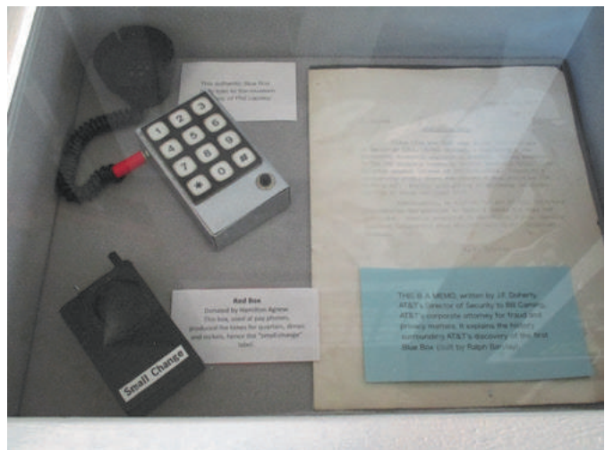
Red Box Small Change and Phil Lapsley's Blue Box

In addition to numerous items from the museum's own collection a number of items were donated